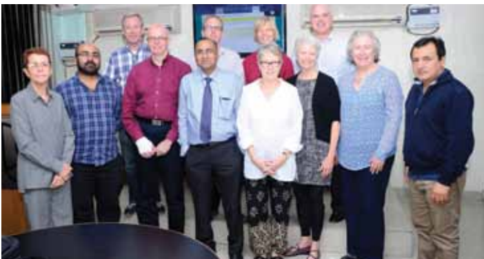
ETD 2015 begins with NDLTD Board Meeting